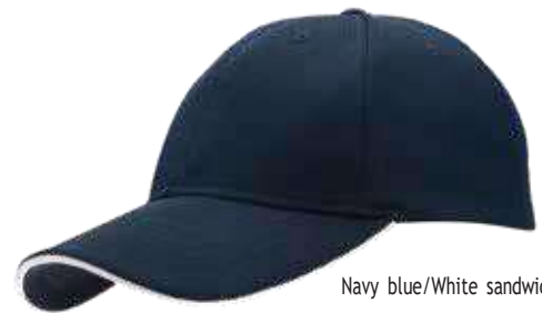
Navy blue/White sandwich

Nu-Fit® Performance Caps are a premium quality 6-panel constructed pique mesh spandex fitted cap, utilizing the patented Stretch-Fitting technology from Nu-Fit®. Stretch fitting by Nu-Fit® has excellent shape retention even after multiple uses and one size fits all. The pique mesh knit provides air ventilation, and spandex provides sweat absorption. Contains contrast sandwich. Santhome Nu-Fit® Performance Caps are an excellent premium cap / sports cap / outdoors / baseball cap.